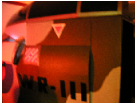
111 Squadrons simulator, that the candidates can now operate.

The practical involved learning how to power up the sim and get the radar