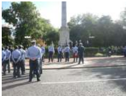
Air Cadet units on parade at the Sunderland Memorial.

by a march past led by the Squadron band.