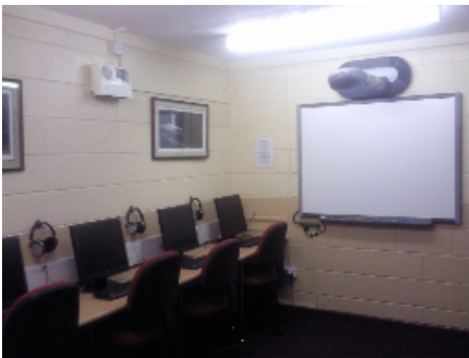
Pictured: The new ICT Suite which replaced training room 6.